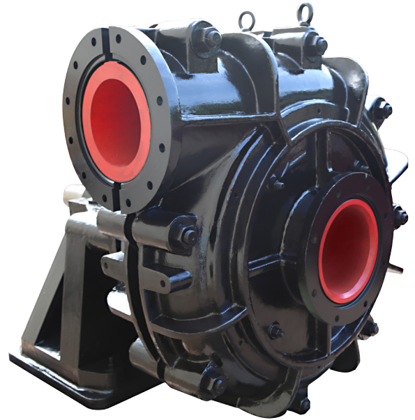
A typical picture of the pump is shown. Please contact Cornell Pump Company for further details. All information is approximate and for general guidance only.

8SPM FRAME MOUNT WITH CHROME IRON LINER 8SPR FRAME MOUNT WITH RUBBER LINER