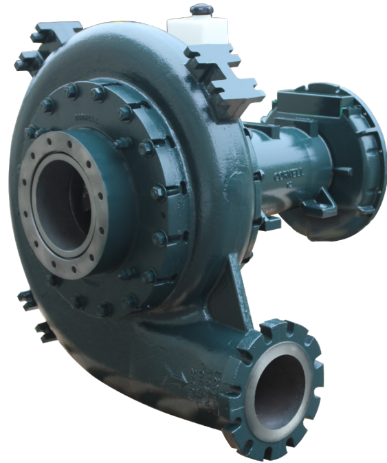
A typical picture of the pump is shown. Please contact Cornell Pump Company for further details. All information is approximate and for general guidance only.