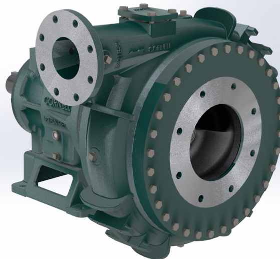
A typical picture of the pump is shown. Please contact Cornell Pump Company for further details. All information is approximate and for general guidance only.